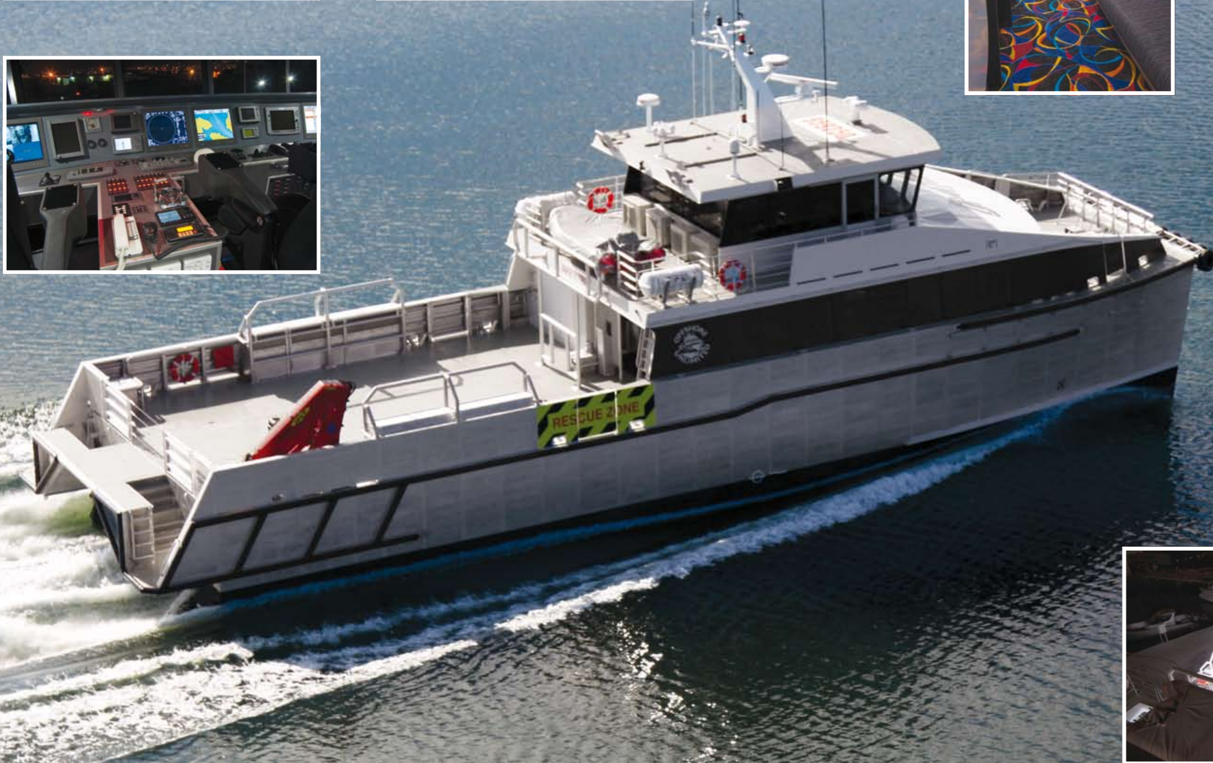
Photography: Roger James 2010